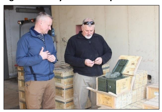
Figure 10. Army Officers Inspect WRSA-I