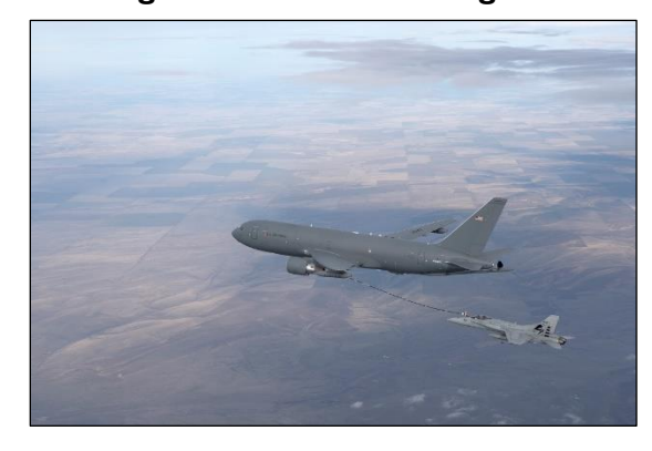
Figure 6.The KC-46A Pegasus

Since 1969, Israel's Air Force has used its Sikorsky Yasur helicopters (CH-53D) to transport personnel and equipment. In upgrading its fleet of transport helicopters, Israel chose the Sikorsky "King Stallion" CH-53K Heavy Lift helicopters over competing systems. In 2021, DSCA notified Congress of a planned sale to Israel of up to 18 CH-53Ks at an estimated cost of $3.4 billion.<sup>80</sup>