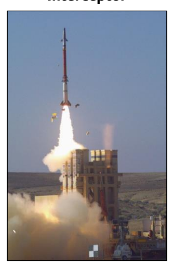
Figure 9. David's Sling Launches Stunner Interceptor

Israel first used David's Sling in July 2018. At the time, Syrian regime forces were attempting to retake parts of southern Syria as part of the ongoing conflict there. During the fighting, Asad loyalists fired two SS-21 Tochka or 'Scarab' tactical ballistic missiles at rebel forces, but the missiles veered into Israeli territory. David's Sling fired two Stunner interceptors, but the final impact point of the Syrian missiles changed midflight, and Israel ordered one of the interceptors to self-destruct; the other most likely landed in Syrian territory. 115 Chinese media claimed that Asad regime forces recovered the Stunner interceptor intact and handed it over to Russia: the Israeli government did not comment on this assertion.116